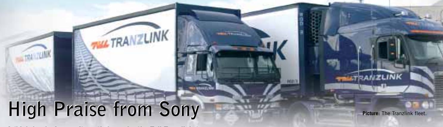
Picture: The Tranzlink fleet.