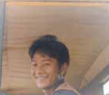
Cover Picture: The first CRC shipment arriving in Vietnam on 19 August with 123 Coils weighing 2,220 tonnes.