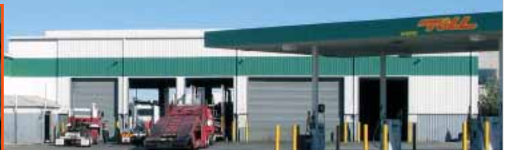
Inset: Prompt servicing ensures a quick turn around with reduced down time.