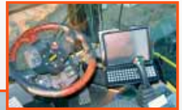
Above: A VX7 Work Order Screen mounted in a QRX Forklift.

information. This has resulted in a significant drop in two way communication and improved QRX machine lifting efficiency. Details of the loading or